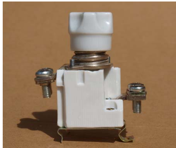
Fig. 2: Size D02 fuse-holder used in tests.